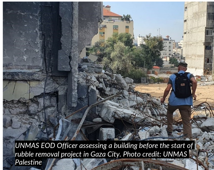
UNMAS EOD Officer assessing a building before the start of rubble removal project in Gaza City.

After the escalation of hostilities in May 2021, UNMAS Palestine conducted 241 building risk assessments for UN agencies which benefited approximately 900,000 people living in the community. In support of street recovery, road construction, and repair of water supply networks, a surface of 517,000m 2 was assessed for a project delivered by international non-governmental organizations and Governmental agencies, benefiting nearly 130,000 people in the community.