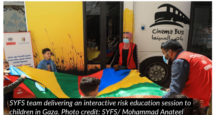
SYFS team delivering an interactive risk education session to children in Gaza.

On 4 April, SYFS sent out their Cinema Bus, which is an initiative launched by SYFS to carry out theatre activities with children, youth, and communities in remote areas of Gaza, to deliver UNMAS videos and interactive explosive remnants of war (ERW) safety messages to children and their parents in remote areas in the Gaza Strip.