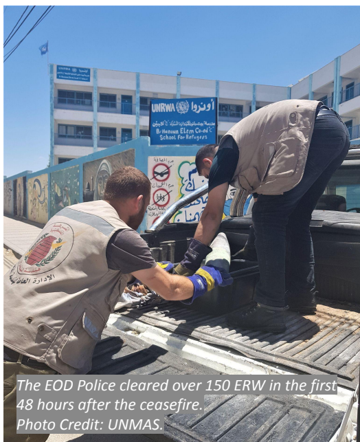
The EOD Police cleared over 150 ERW in the first 48 hours after the ceasefire.

"I have just survived another tough escalation in Gaza. The escalation this time was so intense and scary. Too many people died in a very short time. We all, here, had the feeling that anyone of us could be next, your house, your family [could be next]. We had no control over what was going on outside [around Gaza], all we managed to do was lock ourselves inside our house, watch the news and try to make sure everyone we know, our loved ones, are safe and still alive."