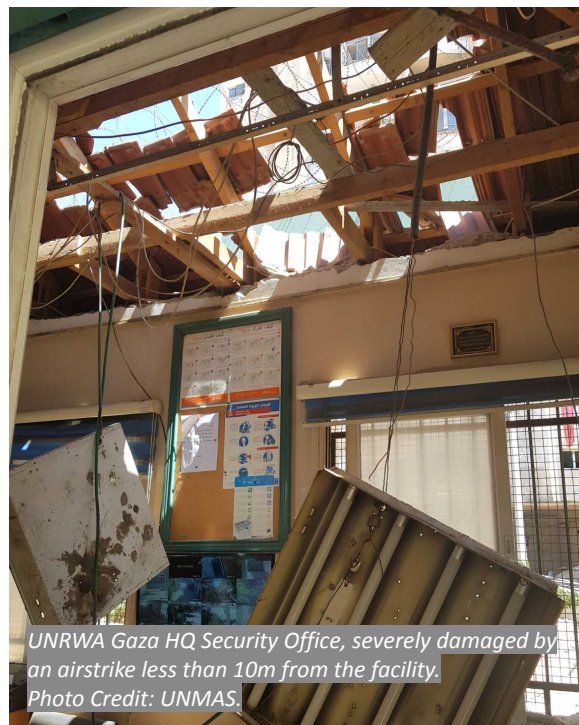
UNRWA Gaza HQ Security Office, severely damaged by an airstrike less than 10m from the facility.

Our EORE Advisor credits Conflict Preparedness and Protection (CPP) for the empowerment she felt during this escalation. CPP is a type of resilience training provided through 6 modules, including ERW safety, basic fire safety, first aid and how to safeguard your property during an escalation. CPP is aimed mostly at women but can be adapted to suit the audience such as Persons with Disabilities (DWP). CPP helps Gazans by equipping them with the knowledge and skills to safeguard themselves against the threat of ERW and escalations, introducing empowerment into a situation that is out of the control of civilians.