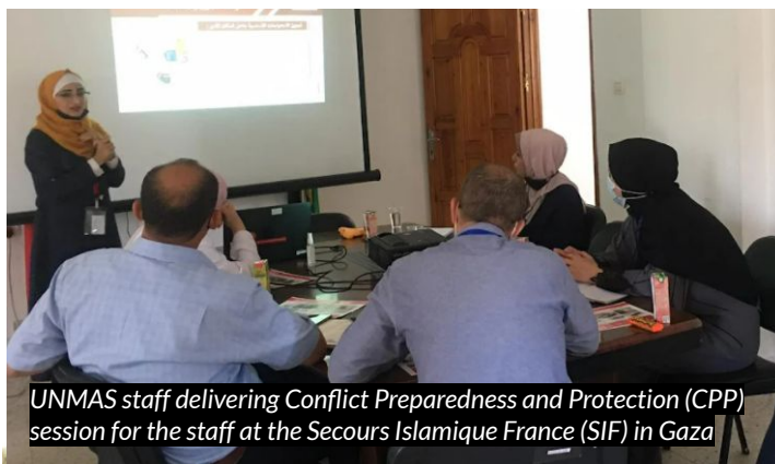
UNMAS staff delivering Conflict Preparedness and Protection (CPP) session for the staff at the Secours Islamique France (SIF) in Gaza

I now have real knowledge about how to deal with burns, and small injuries. I didn't know that. Besides, I will use this information from the CPP for better preparedness in case of future emergencies and not to act randomly"