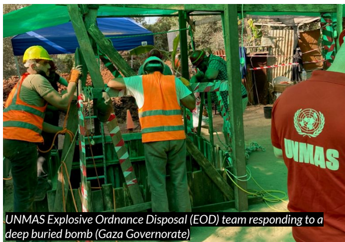
UNMAS Explosive Ordnance Disposal (EOD) team responding to a deep buried bomb (Gaza Governorate)

The UNMAS Explosive Ordnance Disposal (EOD) team and their implementing partner has been carrying out operations to excavate and remove the explosive threats posed by deep buried bombs (DBB) to the communities in Gaza.