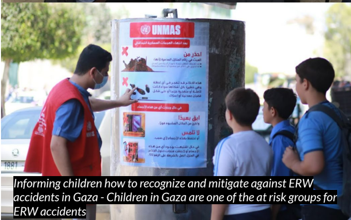
Informing children how to recognize and mitigate against ERW accidents in Gaza - Children in Gaza are one of the at risk groups for ERW accidents